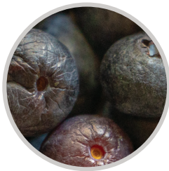
Sorting soft and damaged blueberries