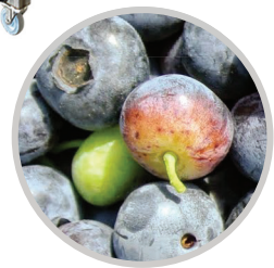
Sorting red and green blueberries