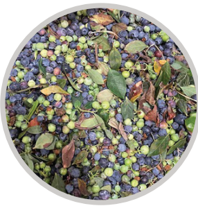
Two separate collection points